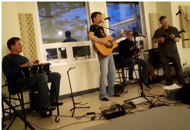
Our April Pub Night featured great live music with community band members. We are looking for someone to help with organizing our new series of pub nights starting in the fall.