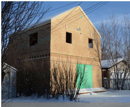
Overheight garage suite on University Ave.

An application to allow an oversize garage suite that is already under construction was refused by city planners recently. Although City Planning would not discuss the reason for the refusal, they note that the structure "may be subject to enforcement action by our Development Compliance team." The garage is part of an infill build, and is clearly over the allowed height. The community